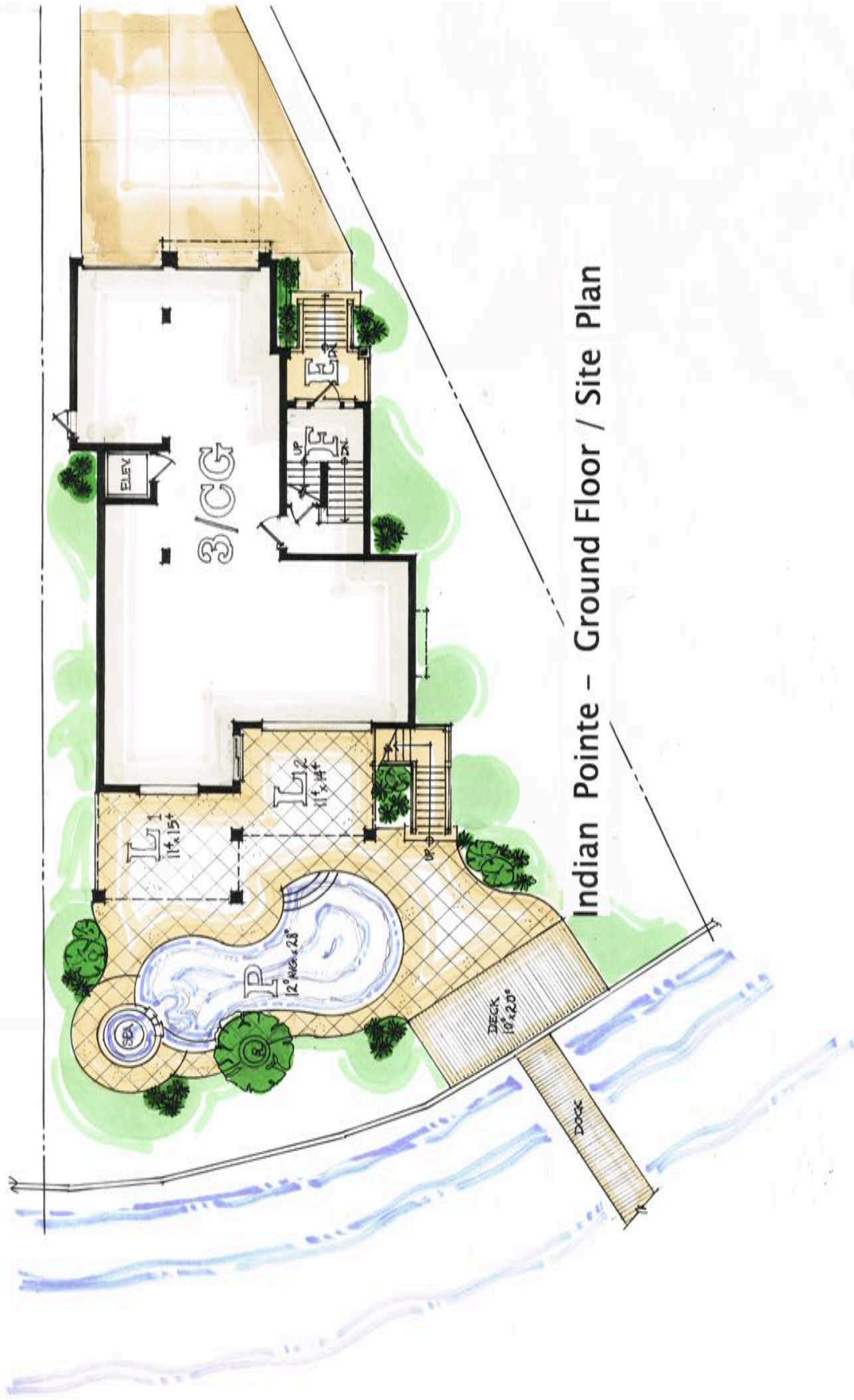
Indian Pointe - Ground Floor / Site Plan